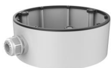
DS-1280ZJ-DM26 Junction box