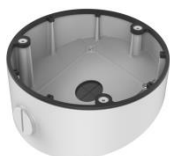
DS-1281ZJ-DM26 Inclined ceiling mount