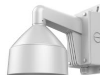
DS-1273ZJ-DM26-B Wall mount with junction box