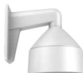
DS-1273ZJ-DM26 Wall mount