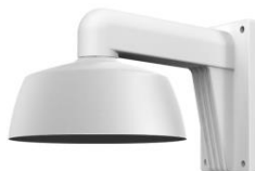
DS-1273ZJ-160 Outdoor wall mount