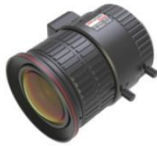
HV3816D-8MPIR Auto Iris Manual Focusing 8MP HD Lens