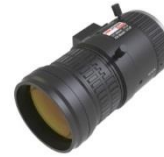
HV1140D-8MPIR Auto Iris Low illumination Manual Focusing 8MP IR Lens