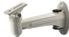
DS-1212ZJ Wall Mounting Indoor