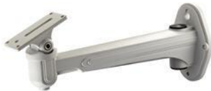
DS-1213ZJ Wall Mounting Outdoor