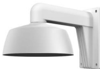
DS-1273ZJ-160 Outdoor wall mount