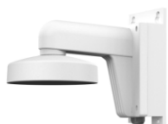
DS-1273ZJ-130B Wall Mount with junction box