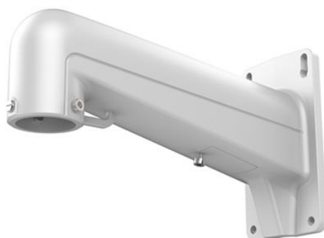
DS-1602ZJ Long-arm Wall Mount Bracket