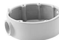
Junction box DS-1280ZJ-DM21