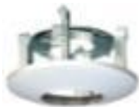
In-ceiling mount DS-1227ZJ