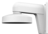
Wall mount DS-1273ZJ-135