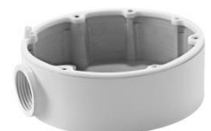
DS-1280ZJ-DM21 Junction box