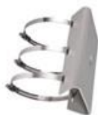
Vertical Pole mount