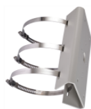
DS-1275ZJ Vertical pole mount