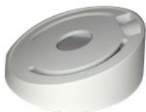
Inclined ceiling mount DS-1259ZJ