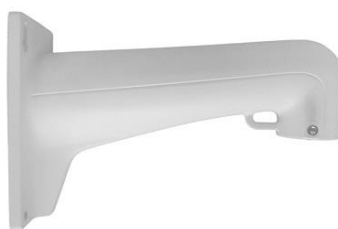
DS-1602ZJ Long-arm Wall Mount Bracket