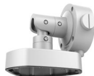
DS-1283ZJ Three axis adjustment