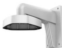
DS-1273ZJ-DM25 Wall mount