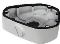
DS-1281ZJ-DM25 Inclined ceiling mount