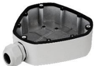
DS-1280ZJ-DM25 Junction box