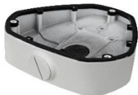
DS-1281ZJ-DM25 Inclined ceiling mount