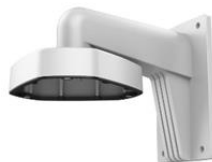
DS-1273ZJ-DM25 Wall mount