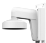
DS-1273ZJ-130B Wall Mount