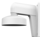
DS-1273ZJ-130 Wall Mount