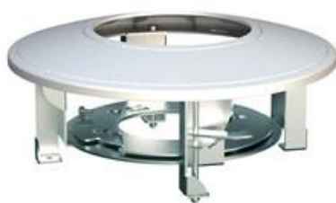
Indoor in-ceiling mount DS-1227ZJ